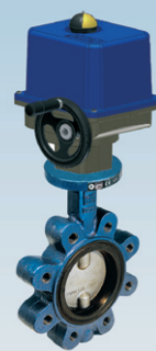
ATT. ELETTRICO (dal DN250 al DN400) EQ 24 VAC / 230 VAC / 400 V 3N