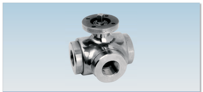
TRISTAR PER ATTUATORE