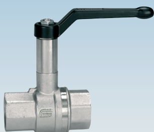
art. 2170 f/f con leva alluminio nera da 1/2" a 2"