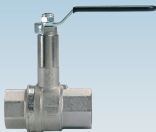
art. 2172 f/f con leva acciaio da 1/2" a 2"